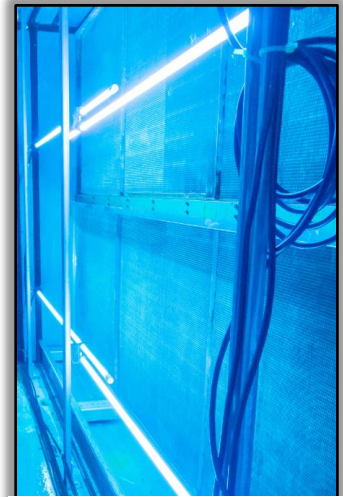
The RLM Xtreme fixtureless UV-C lamp system generates up to twice the ultraviolet irradiation levels as fixtured lamp systems.

In the end, a post-project audit documented a 43.7% increase in one air handler’s airflow levels following the UV-C installation, which also reduced energy use enough to pay for the upgrade in just five-months—an impressive return on investment.