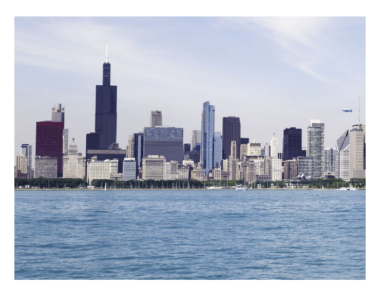
With HVAC systems accounting for as much as 50 percent of a commercial building's energy use, efficiency is a priority in system design. A new Department of Energy pump efficiency standard is changing the way engineers select pumps for hydronic systems.

With an HVAC system accounting for up to 50 percent of a commercial building's energy use, designing efficient heating and cooling systems is critical to keeping a project on budget as well as meeting sustainability goals. Variable speed drives often are applied to existing systems to increase overall