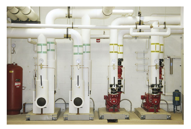
Beginning in January 2020, clean water pumps sold in the United States must meet efficiency standards and include efficiency information on the pump nameplate.

In the second example, Pump A has a lower PEIVL than pump B, but that does not necessarily mean it will cost less to operate in a system. Different types of pumps have different baselines; engineers should be sure they aren't making an apples-to-oranges comparison. Using a related example to illustrate the point, if the energy rating on a refrigerator is lower than the energy rating on a furnace, that doesn't necessarily mean that the furnace will be cheaper to operate.