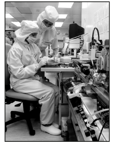
Operators in a clean room 2

Indoor RH control has become a critical need, and the number of commercial and industrial steam humidification systems in the world has never been higher.