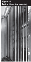
Figure 1-1 Typical dispersion assembly

Shown here is a typical steam dispersion tube panel with insulated stainless steel tubes installed to open the full height and width of an air handling unit.